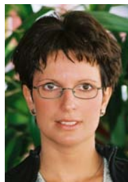
Eszter Horváth Tóthné President of the Congress